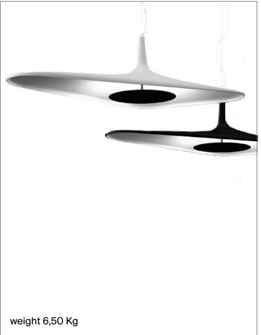
weight 6,50 Kg