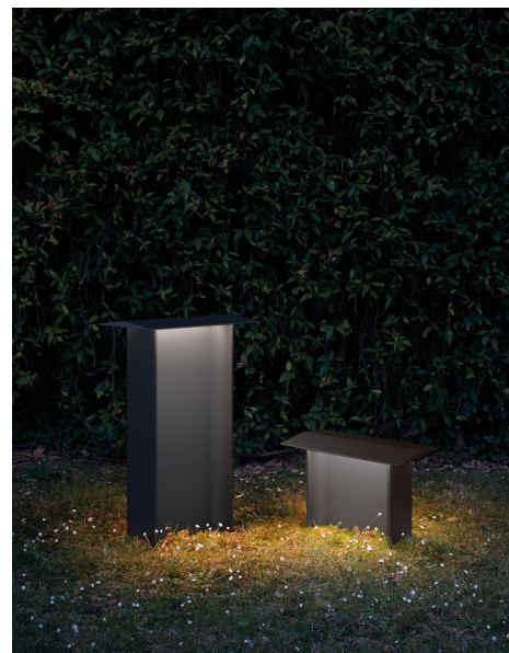
D98TM1 + D98/2

Reference code: optic D98TM1 1D980TM10005 Dark grey 1D980TM10020 Light grey structure H 32 cm D98/2 1D980/020005 Dark grey 1D980/020020 Light grey structure H 72 cm D98/3 1D980/030005 Dark grey 1D980/030020 Light grey remote drivers ( the junction box is recommended IP68) D98/5 1D980/050000 remote driver on/off D94/1 1D940/100000 independent remote driver