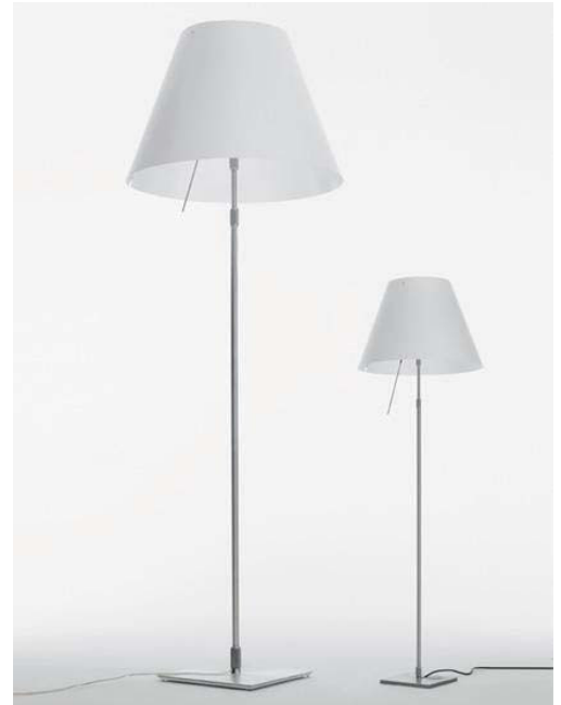
D13G t. - D13G t.i